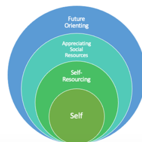
Figure 2: Inside Out Connections (Shikano, Deacon, & Yamagishi, 2021)

Future orienting (career/academic/ lifestyle orientation). The study can conclude that the CLIL-based short-term SA can lead to self-change in several value-added dimensions and that the changes are interrelated, as illustrated in Figure 2. (Reported in the 2021 Annual CamTESOL Conference, Poster.)