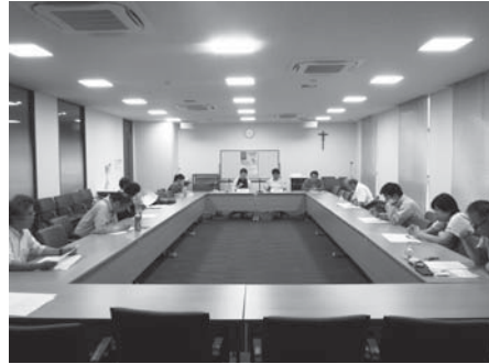
View of lecture meeting