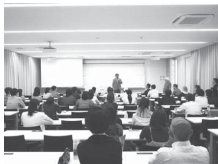
View of lecture meeting