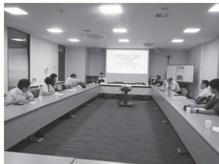
View of lecture meeting