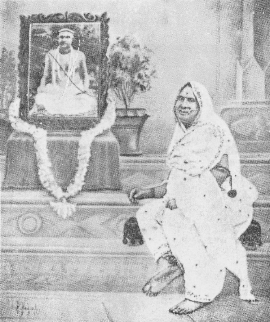
Figure 2. Lalitā Sakhī Mā of Vrindavana.