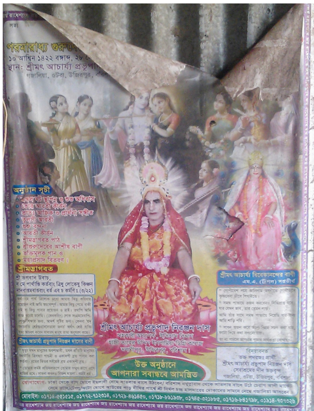
Figure 3. Poster advertising a religious gathering in Barisal (Bangladesh). 2016.

These instances of gynemimesis are different from the meditative transcendence of gender observed among Bauls and Fakirs. Here the devotee is not “becoming woman in order to unite with a woman.” The connotations of āropa as prescribed