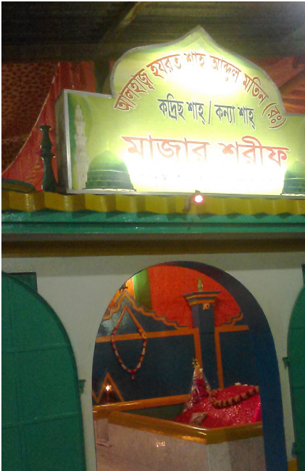
Figure 4a. Sufi shrine of Kanyā Śāh, in Sylhet (Bangladesh). 2016.