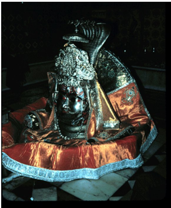
Figure 6. Śiva worshipped as Gopeśvara in Vrindavana.