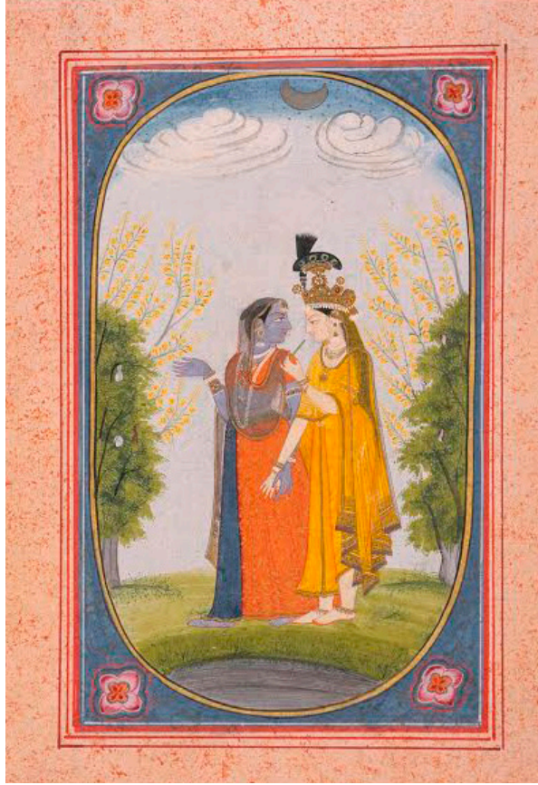
Figure 7. Rādhā and Kṛṣṇa dressed in each other's clothes. Kangra, ca. 1800.

galpa (Just Another Love Story), a film about a transgender cinematographer documenting the life-story of the cross-dressed theater performer Chapal Bhaduri. 57