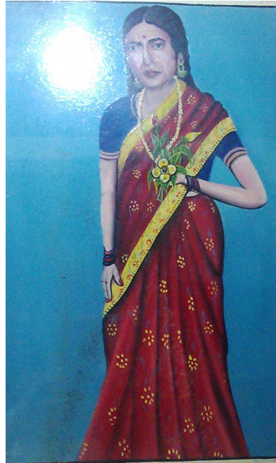
Figure 4b. Portrait of Kanyā Śāh displayed on the wall of the shrine, in Sylhet (Bangladesh). 2016.

female clothing (see Figure 5). Followers of this lineage replicate the deeds of the founder by dressing up as brides to express their devotion.